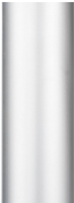
2" DIAMETER POLE

Stainless steel bolts and reinforced grommets secure the canopy and prevent fabric tearing. A commercial grade easy gliding double pulley and pin system (not push up), marine grade corrosion resistant aluminum frame with stainless steel hardware, and a modular construction add to the resilience of this already superior umbrella.