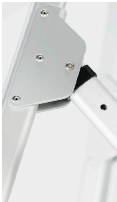
DOUBLE REINFORCED JOINTS