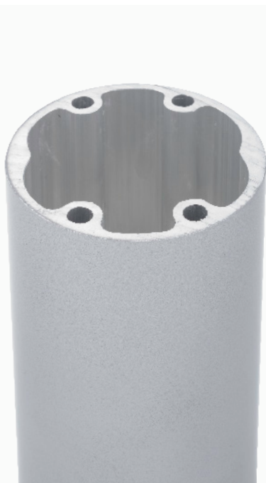
STRENGTHENED EXTRUDED ALUMINUM MAST

Umbrellas comparable to the Nova in size and weight almost always require a permanent installation. The Nova is one of the only large shade structures in the industry with a semi-permanent and non-permanent mount available. This umbrella not only looks spectacular, but can be mounted on any surface for multiple commercial applications.