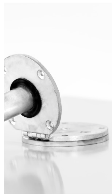
HINGED SPIGOT INSTALLATION