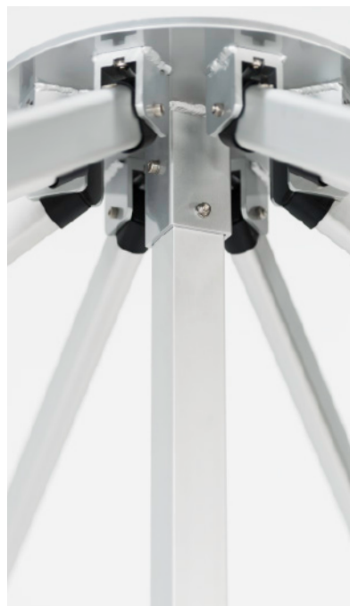
TELESCOPING CRANK SYSTEM