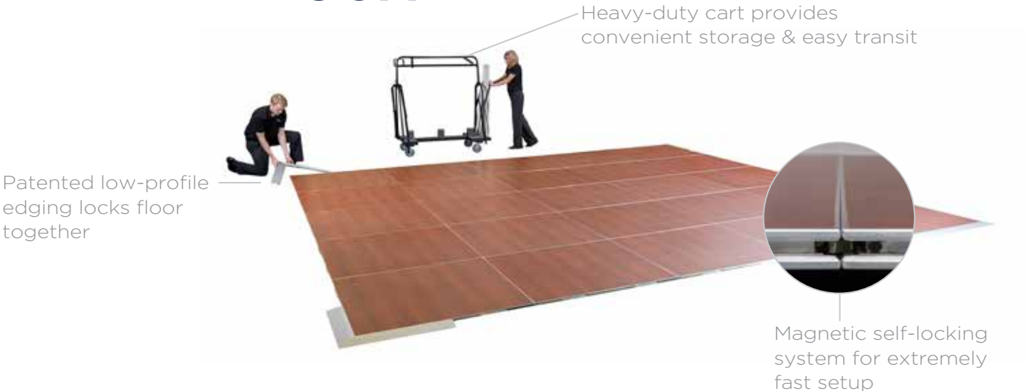
Patented low-profile edging locks floor together