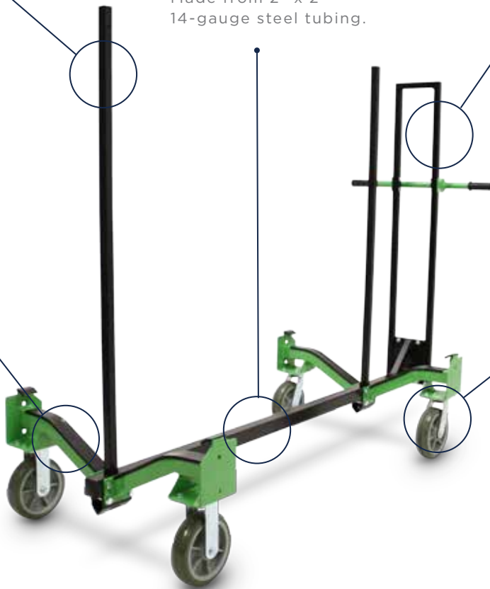
Table carts are shipped knocked down to reduce shipping costs. Assembly is fast and easy to do with simple hand tools.

925 lb. capacity, equipped with 8" diameter, 2" wide, polyurethane wheels with precision ball bearing axles. Optional brakes and 4-wheel turning is available.