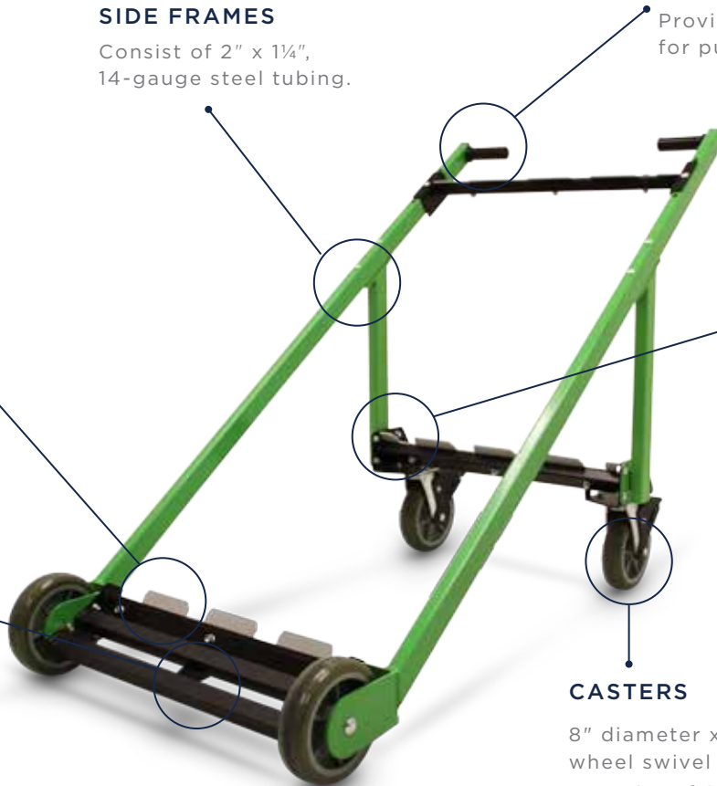
Table carts are shipped knocked down to reduce shipping costs. Assembly is fast and easy to do with simple hand tools.

8" diameter x 2" wide, polyurethane wheel swivel casters have a load capacity of 925 lbs. each.